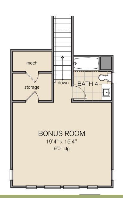
WESTWIND - Bath 4 i/l/o Powder Bath TOTAL LIVING: 4,064 S.F.